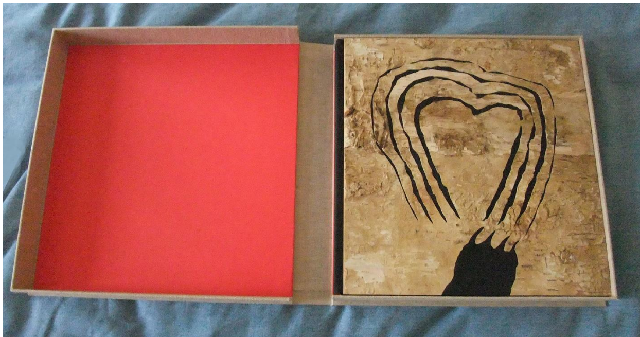
Cover and box of Magaril's Masha and the Bear (New York, 2020).

Cornell's world-renowned Human Sexuality collection was enhanced with titles produced in Russia, Armenia, and in emigration from the 1970s, 1990s, and 2000s, including Aleksandr Afanasiev's Erotic Tales of Old Russia (Oakland, 1988), illustrated by Alek Rapaport; Eroticheskie taro . (M., 2003); and Pol'naia seksual'naia entsiklopediia (Kharkiv, 2010).