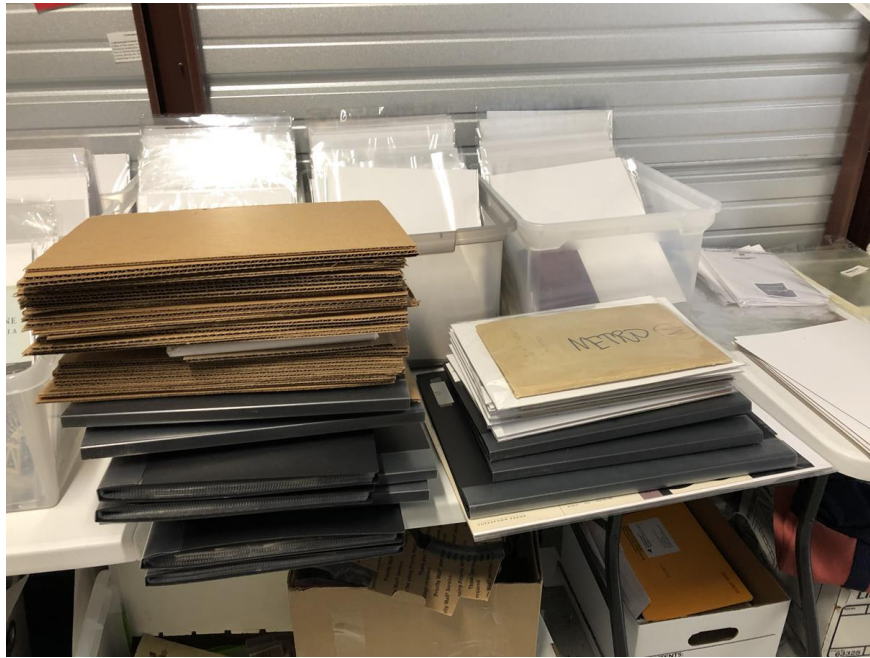
The Šváb Archive before processing.

Through the support of the Primary Resources Fund, and the Avery Classics Library, Columbia acquired the graphic artist Jaroslav Šváb's (1906-1999) personal archive of approximately 650 items, including printing samples and specimens, test printings, alternate variations, publisher's ephemera, and original renderings, spanning the period 1928-1968.